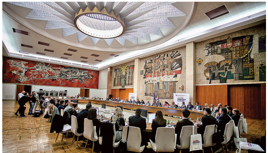
Important accomplishments and highlights from the successful implementation of the project were presented at the Final Conference held on October 29 th , 2018 at the Palace of Serbia in Belgrade

During the last two years, the project was successful both, in terms of informing potential clients about the availability of our services and addressing many property & labor rights cases through four legal offices and two partner NGO legal aid offices in Kosovo. Some of these impressive statistics are reflected in the number of new cases opened (3,000) and number of court hearings attended on behalf of our clients (759).