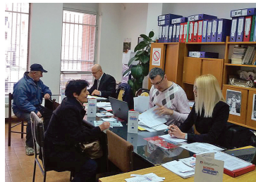
Free Legal Aid Mobile Team in Kragujevac

They presented a total of seventeen legal issues, including five problems related to labor disputes, five problems of usurpation of property in KiM, four related to damaged property in KiM and three requests for obtaining documentation in places of origin.