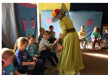
Interaction with kids in Subotica