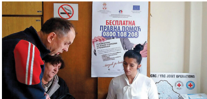
Free Legal Aid Mobile Team in Kruševac

On January 11 th , 2018 in Kruševac the Free Legal Aid Mobile Team met with thirteen internally displaced persons from Kosovo and Metohija. The team signed contracts and power of attorneys with the parties and collected the necessary documentation, and preparation of submissions for further proceedings, is in progress.