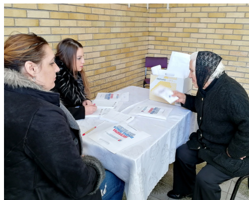
Free Legal Aid Mobile Team in Štrpce

A total of 124 residents currently live in the collective centers „Junior“ and „Lahor“, mostly displaced people as well as 8 refugees from Croatia and BiH. The average age of the residents is above 40 and a total of 15 families with children live in both collective centers. The municipality of Štrpce has two more collective centers with total of 42 residents.