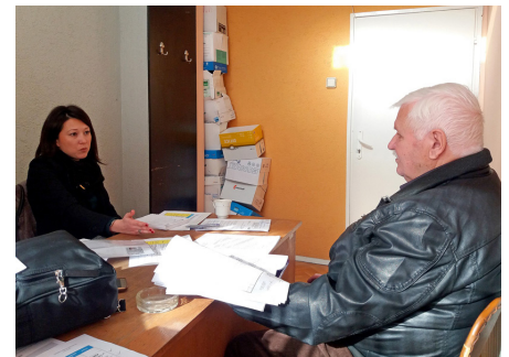
Free Legal Aid Mobile Team visited parties in Smederevo

On January 29 th this year, the Free Legal Aid Mobile Team, provided by Belgrade's Project Office, met potential clients, who have unresolved legal problems in KiM, but are unable to visit one of the project offices, at the office of Trustee for Refugees and Migration in Smederevo. The Free Legal Aid Mobile Team met at the trustee's office with three internally displaced people with legal proprietary issues and with two people who have ongoing proceedings for damage compensations against UNMIK, KFOR and PIK, but are not IDPs. The Free Legal Aid Mobile Team filled out applications for free legal aid and collected the documentation. After the meeting at the trustee's office, the team paid a house visit to an IDP whose property in Prizren is usurped. The team filled out the application and collected the documents necessary for case opening.