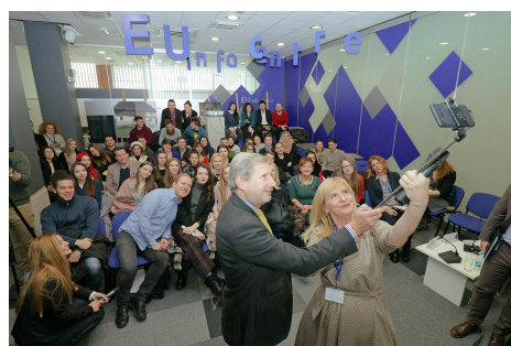
Mr Hahn's dialogue with Citizens of BiH and after-session selfie