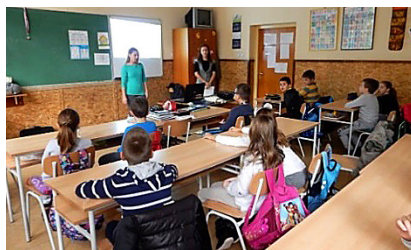
Secondary chemistry-technical school "Lazar Nešić" in Subotica

Realized educational activities represent an introduction to the education of the population of the Subotica region, which will be implemented intensively when the regional waste management system starts operating at full capacity.