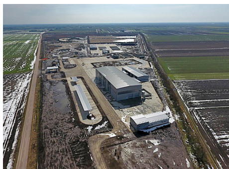
Construction of a landfill in Subotica

The project "Building a regional solid waste management system for the City of Subotica and the municipalities of Bačka Topola, Senta, Kanjiža, Čoka, Mali Iđoš and Novi Kneževac" has in-built within it a comprehensive regional waste management system. In this year, the Regional Waste Management Center in Bikov started working, financed by the European Union, and hence the employment of new employees is expected.