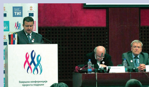
Serbian Prime Minister Mr. Ivica Dacic, opening the conference

The first National conference 'Serbia against Cancer' was held on June 4th 2013 in Sava Center, Belgrade. It served primarily as a platform for the presentation of final results of the project implemented by ECG "Technical Assistance for the Implementation of the National Screening Programme for cancer" funded by the European Union pre-accession funds for Serbia with 1.8 million Eur. The conference was opened by the Prime Minister of Serbia, Ivica Dacic, and speakers included the Minister of Health of Serbia, Prof. Dr. Slavica Djukic Dejanovic, EU Delegation Ambassador, Dr. Vincent Degert, Project Team Leader Prof.Dr. Dusan Keber, and Prof.Dr. Jean Faivre. The conference was attended by health professionals and representatives of local governments from Serbia who are taking part in the project implementation, in addition to the project team members and partners.