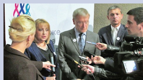
Minister of Health, Prof.Dr.Dejanovic, with Project Team Leader, Prof.Dr.Keber, and Ambassador of the EU Delegation in Serbia, Mr. Degert

Technical preparations within the Serbian health system for implementing the national program 'Serbia against Cancer' have been successfully completed and healthcare facilities are now ready to begin the first cycle of cancer screening. The goal of the national program is the introduction and promotion of organized screening for early detection of breast, cervical and colorectal cancer in the Republic of Serbia. As emphasized at the conference, and following the successful implementation of the project, the health system of Serbia is now fully competent to carry out the cycle of screening for cancer.