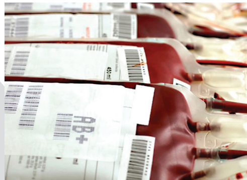
Strengthening of the Blood Safety System in Macedonia

An opening conference marked the launch of the EU-funded project “ Strengthening of the Blood Safety System ” implemented by ECG in consortium with Epos Health Management and the Serbian Institute for Blood Transfusion, in cooperation with the Ministry for Health of Macedonia. The event took place on May 29th 2013 at the EU InfoCentre of the Delegation of the European Union in Skopje, Macedonia. Project stakeholders were welcomed by the EU Ambassador Aivo Orav, Nikola Todorov, Minister of Health, and Hendrik W. Reesink, Team Leader of the project.