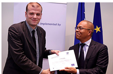
Confirmation of acquired knowledge on trainings was proven by the certificate