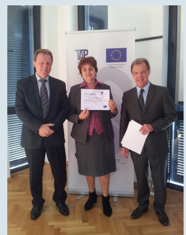
Certificates awarded to participants.