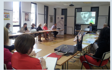
Participants in training