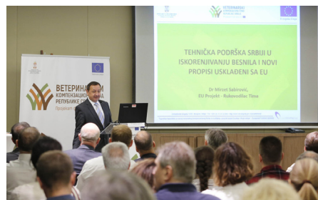
Working atmosphere at Crowne Plaza

A program for prevention and control of rabies, supported by the European Union, has been active in Serbia for years. The most obvious results are that there are now only three cases of rabies in the wildlife population recorded during 2014 and 2015. The last case of rabies in domestic animals was recorded in 2012. Thanks to EU technical assistance projects, a new strategy for combating rabies 2015-2022 proposes effective monitoring of vaccination and its efficiency among domestic and wild carnivores, as well as raising the level of preparedness for managing outbreaks, including public awareness.