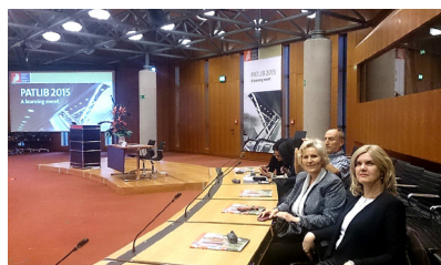
PATLIB Conference held in Munich

Within this project a series of three Round-table sessions titled “Role and Importance of IP in the performance management of innovation in universities, research institutes and companies” have been organized during March 2015, the objective being to improve cooperation and prepare a training plan for these institutions.