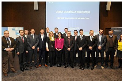
Managing Board of the Serbian Association of Managers

During their term, the priorities of the Board will be the continuous cooperation with the Government and its institutions and the implementation of joint activities for economic growth, fight against shadow economy and support to the development of entrepreneurship. Part of the activities will be focused on business networking, education and promotion of managerial staff, with special focus on young managers.