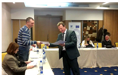
Awarding of certificates to participants of the training

Within the EU funded project “Training in Administrative Procedures in BiH” , training for managers of administrative procedures and public administration inspectors was successfully completed in Sarajevo. They attended the interactive trainings for six days, in the period from February 20 – March 12, 2015, and had the opportunity to hear about the best practices in the implementation of the Law on Administrative Procedures.