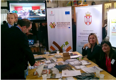
ECG's stand at the first EU-funded projects Fair in Serbia