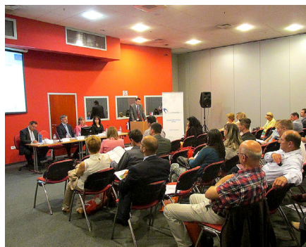
Public-private forum at the 82. International Agricultural Fair