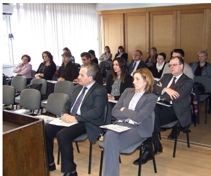
Workshops on the importance of industrial property

The series of workshops were intended to offer to the whole network of specialists from both GOs and NGOs dealing with innovation and IP or IP related matters, enabling the target audience that once the basic concept of IP are presented, to be able to incorporate them in their strategy to facilitate, support and use IP as a tool of innovation and transfer of technology.